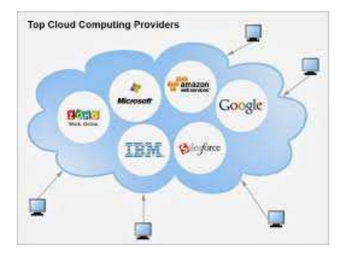
Figure 2: Cloud Computing Companies

the help of IT experts, all the factors like pricing, availability, support, service levels and other technical issues to be considered for choosing best cloud computing company.