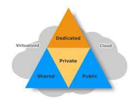
Figure 3: Types of Cloud Computing Companies